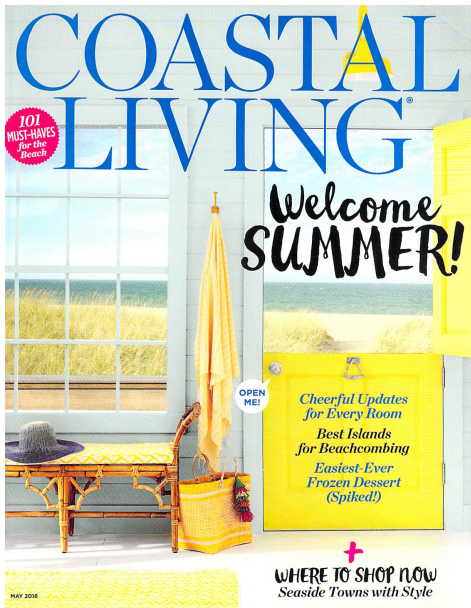
May 2016 COSTAL LIVING MAGAZINE Page 65