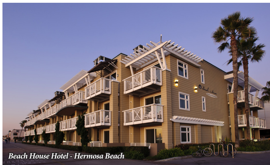
Beach House Hotel - Hermosa Beach

And as you breathe in the salty ocean, there's a lot of shopping to do on Hermosa's Pier Avenue. Plus, when all of your souvenirs are already bought, you can take your shopping to a new level and visit nearby Manhattan Beach downtown with more fine local shops and